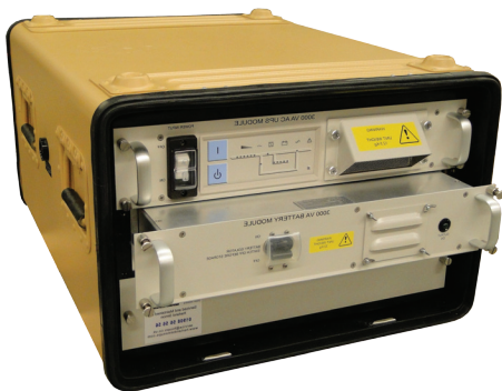
3 kVA/10 minute Case Mounted AC UPS

Our Case Mounted UPS is designed for field deployment into harsh battle conditions while the 19" Rack Mounted UPS is built from a COTS UPS then modified, ruggedised or customised for the customer's application whereas the Fixed or Vehicle/Vessel Installation is a rugged free standing UPS that is welded/bolted into vehicles/vessels via AVM to withstand shock & vibration.