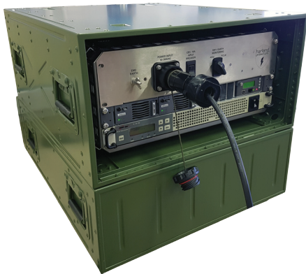
UPS & Battery Pack (front)