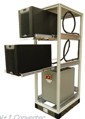
10 kVA N+1 Converter