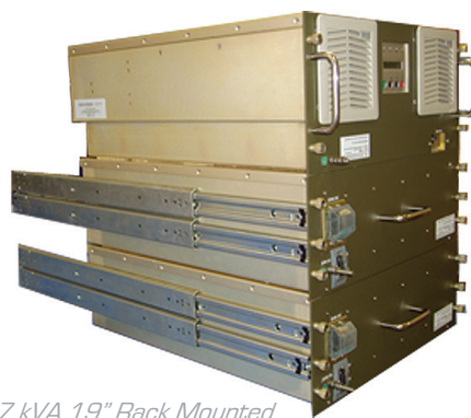
7 kVA 19" Rack Mounted