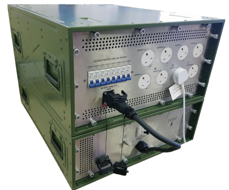
UPS & Battery Pack (rear)