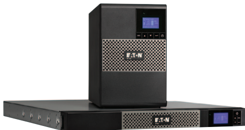
Available in tower and rack 1U format