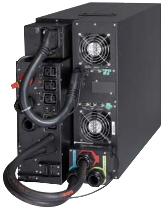
9PX 11kVA with maintenance bypass

9PX 1:1 is an Energy Star® qualified UPS