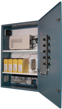
1 - 3kVA Wall Mount IP54 UPS