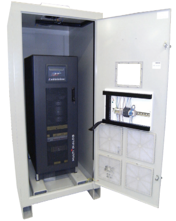
1 - 120kVA Floor Standing IP54 UPS