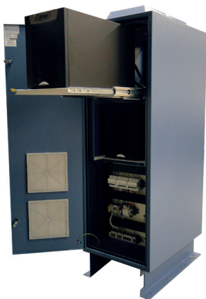
1 - 5kVA Floor Standing IP54 UPS