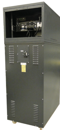
1 - 11kVA Floor Standing Long Runtime IP21 UPS