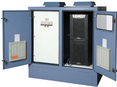
1 - 30kVA Floor Standing IP54 UPS