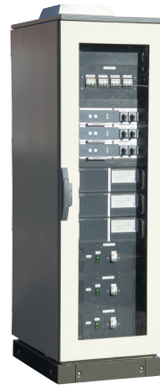
1 - 120kVA 19" Rack IP54 UPS