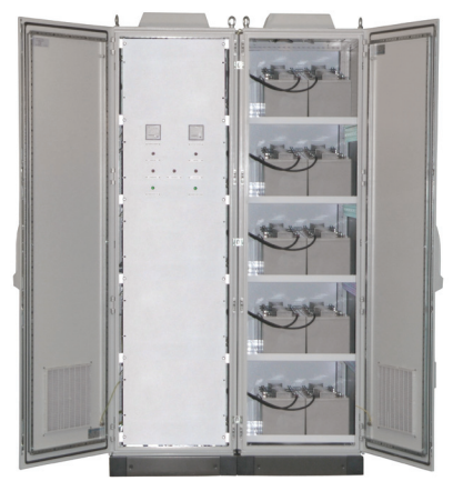
1 - 200kW Floor Standing IP54 DC UPS

Harland Simon UPS Ltd • Bond Avenue • Bletchley • Milton Keynes • MK1 1TJ T: 01908 56 56 56 • E: enquiries@hsups.co.uk • W: harlandsimonups.com