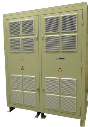
100 - 600kVA Floor Standing IP54 UPS